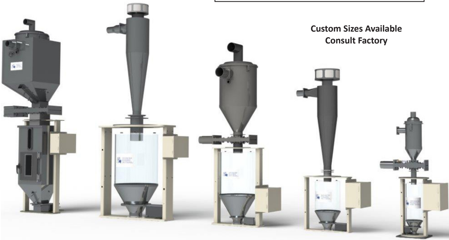
Custom Sizes Available Consult Factory